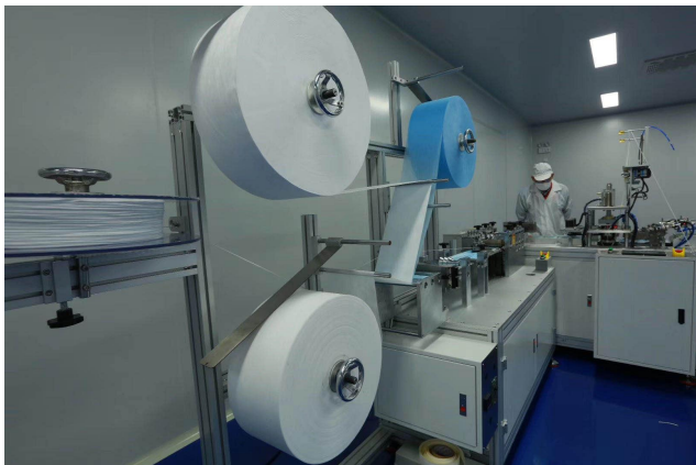
Dust-free clean face mask workshop