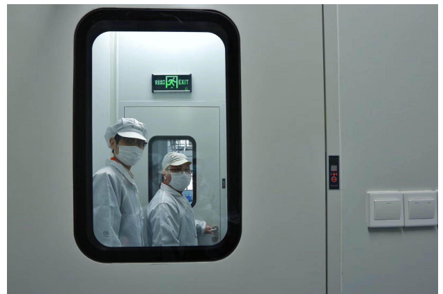
Class-100,000 clean room